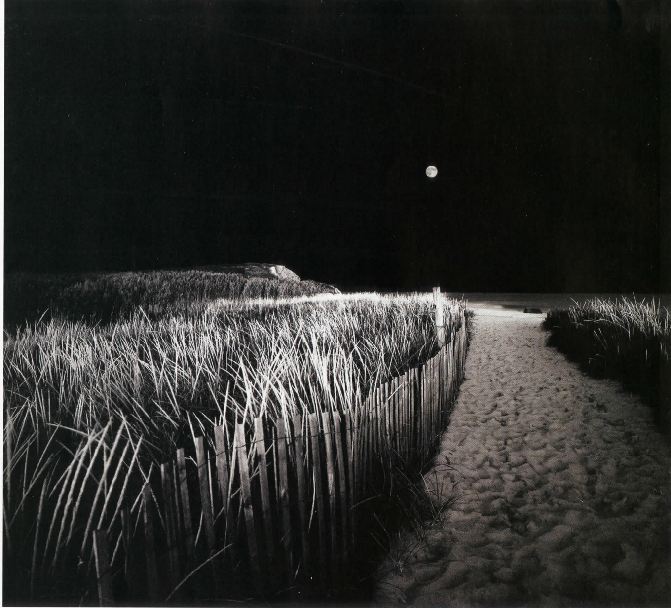
MOONRISE, C-PRINT, 48 x 48"