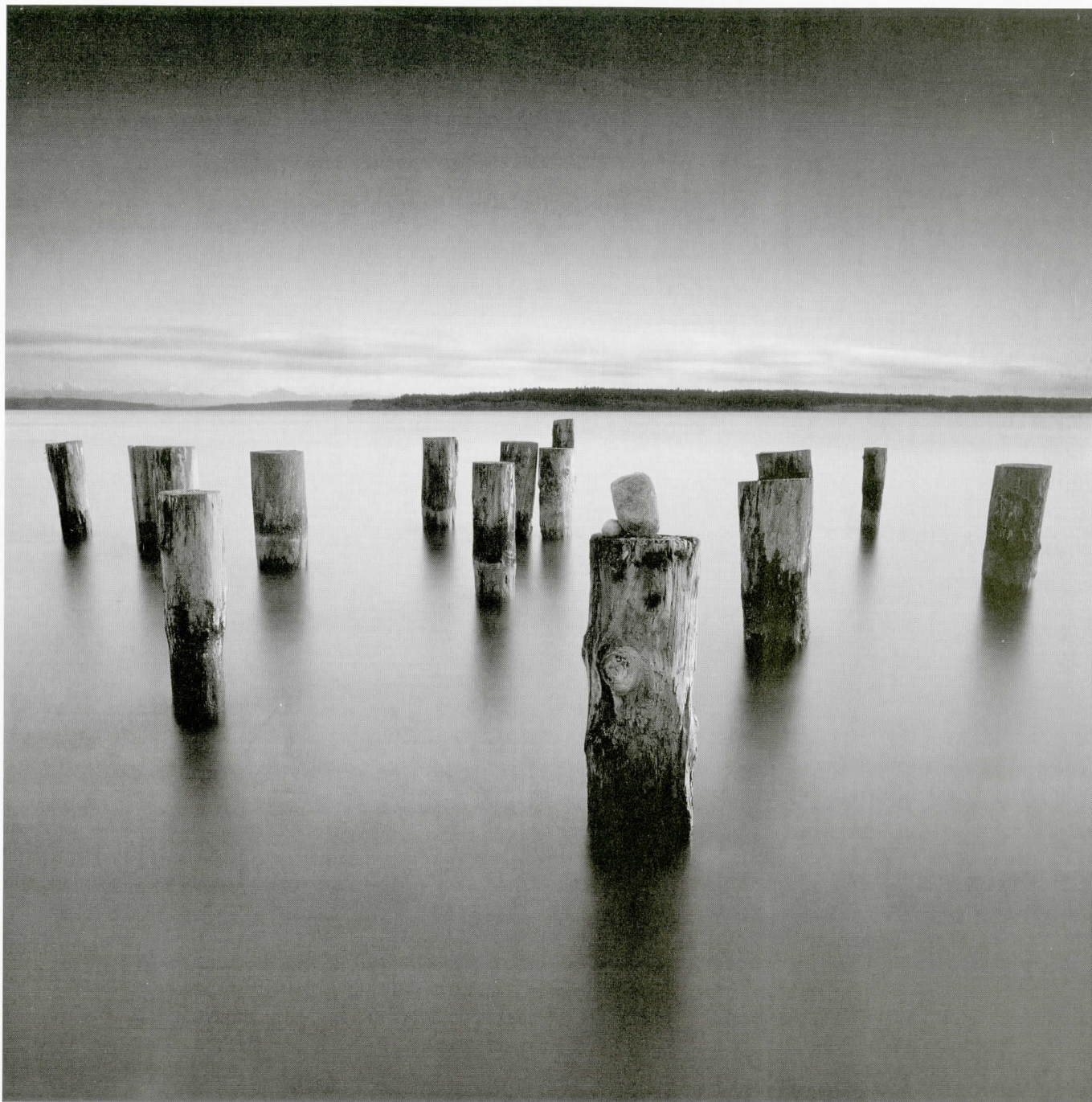
BALANCED STONES, C-PRINT, 48 x 48"