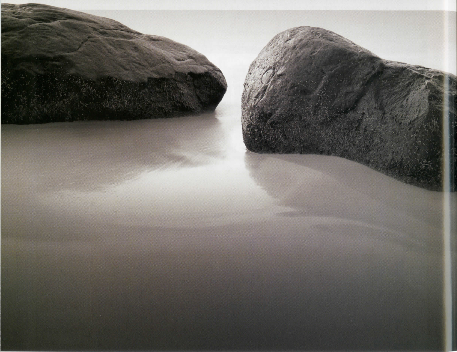
TWO ROCKS, STUDY, C-PRINT, 48 x 48"

world is based upon our total experience," says Fokos. "The ocean has always made me feel calm, relaxed, and content. If I were to take a snapshot of the ocean, the photo would include waves with jagged edges, salt spray and foam. This type of image, while very dynamic, does not make me feel calm—it doesn't represent how the ocean makes me feel as I stare out over the water."