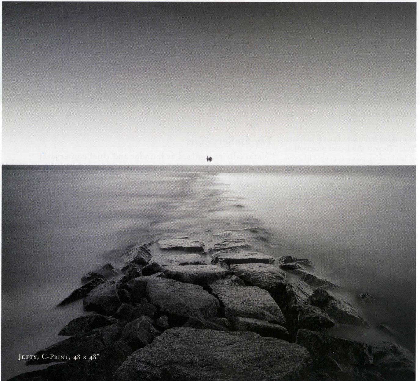
JETTY, C-PRINT, 48 x 48"